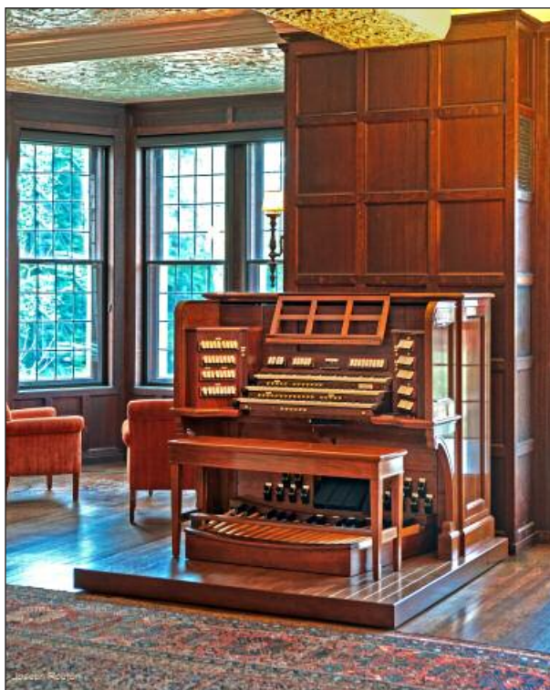
Aeolian-Skinner, 3 manual

Aeolian-Skinner Opus 878 was originally designed in 1931 and installed as a residence organ at Pleasantdale in West Orange, NJ. It was recently reinstalled at Stoneleigh by Emery Brothers.